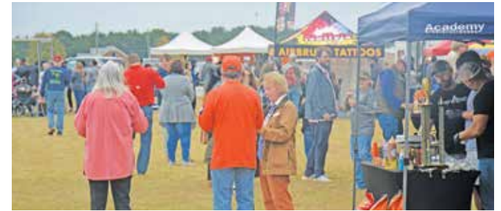
2 DAY BBQ COMPETITION FEATURING TEAMS FROM THROUGHOUT SC