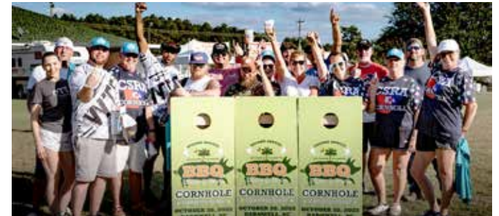
FAMILY FUN INCLUDING HALLOWEEN ACTIVITIES & A CORNHOLE TOURNAMENT

Your Sponsorship is important to help bring all of these elements together for this annual event that supports your local Chamber of Commerce! It ensures we continue to improve the vitality of local businesses in Barnwell & Allendale Counties through important programs and economic development efforts.